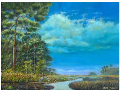
"The Savannahs" 30" x 40"