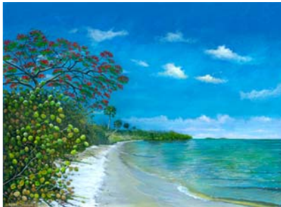
"Seagrape Beach" 30" x 40"