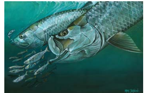
"Tarpon And Mullet" 24" x 36"