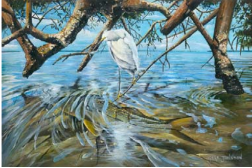
"Bait Watcher" 24" x 36"

All originals are acrylic on canvas or board • Commissions welcome • Giclees available • www.MarkJohnsonArtworks.com