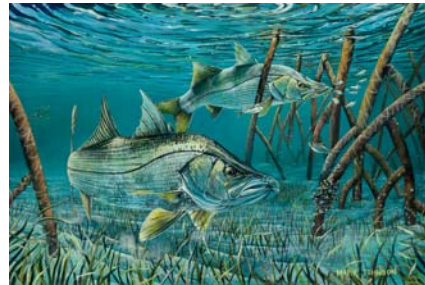
"Mangrove Marauder" 24" x 36"