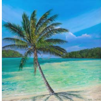
"Bonefish Bay" 30" x 30"