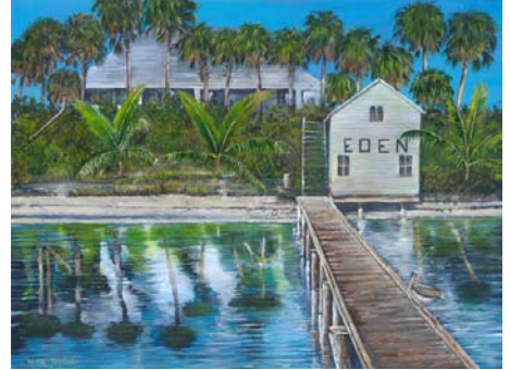
"Eden" 30" x 40"