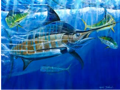
"Big Blue" 36" x 48"

All originals are acrylic on canvas or board • Commissions welcome • Giclees available • www.MarkJohnsonArtworks.com