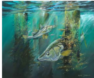
"Snook At The Dock" 30" x 36"