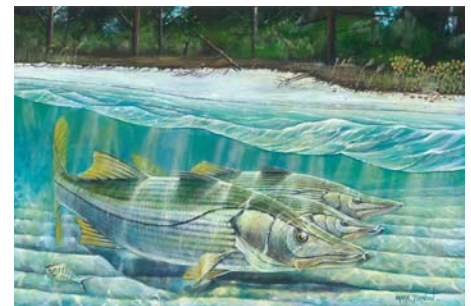
"Snook On The Beach" 24" x 36"