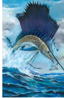
"Flying High" 24" x 36"