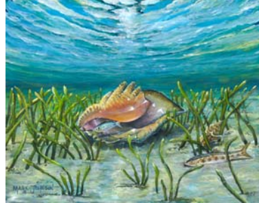
"Conch" 16" x 20"