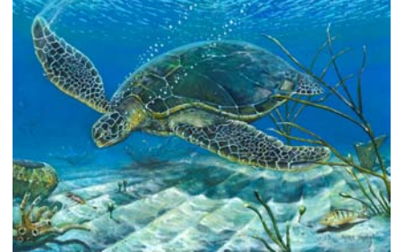
"Green Turtle" 24" x 36"