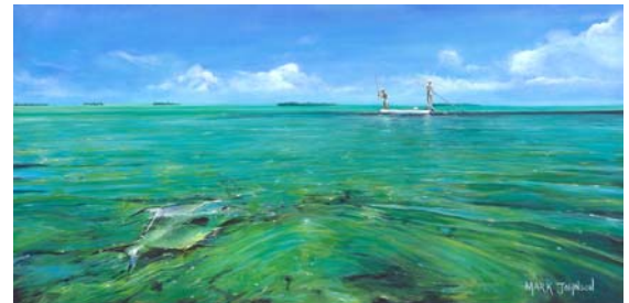
"Permit Flats" 18" x 36"