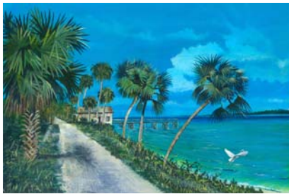
"Indian River Drive" 24" x 36"